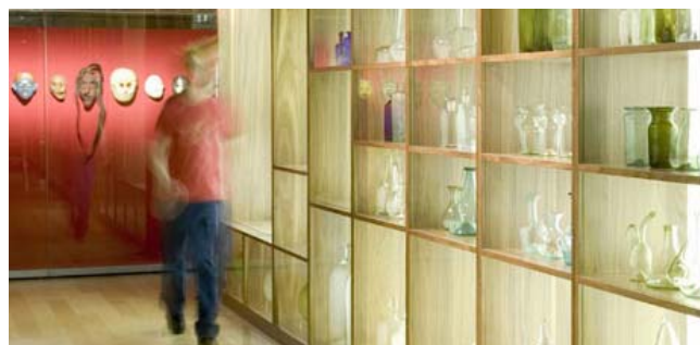
"Medicine Man" gallery, Wellcome Collection, London