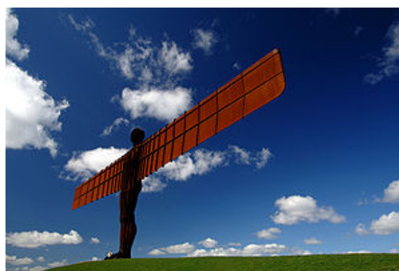
Gormley's Angel of the North