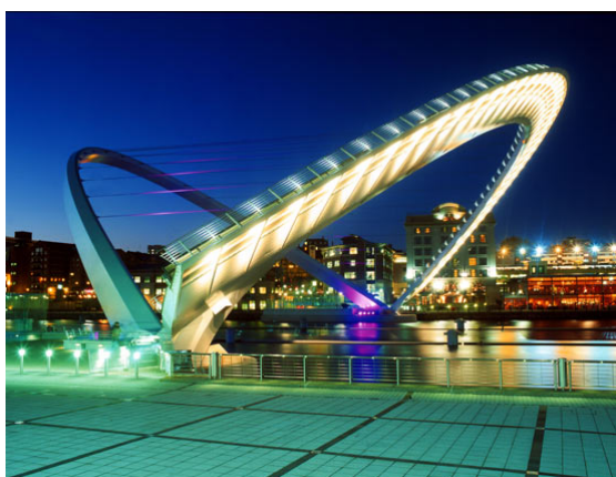
Gateshead Millennium Bridge